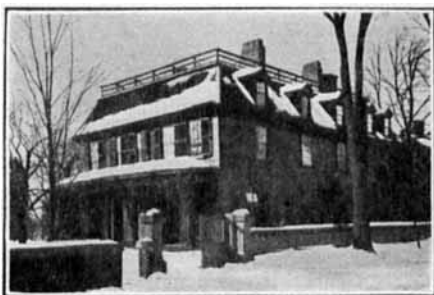
Vassall House—Headquarters Medical Department.